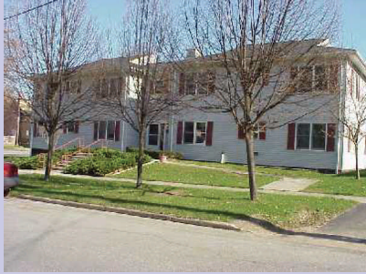
Transitional Living Single Site Apartment Building.