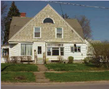
Transitional Living Supervised Residence