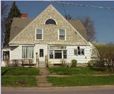
Transitional Living Supervised Residence