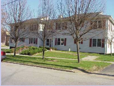
Transitional Living Single Site Apartment Building.