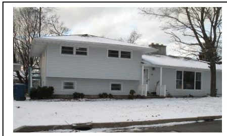
36 Draper St