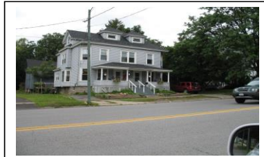
406 West Broadway