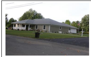
198 W. 4 th St. N.