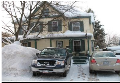
8 & 10 South 3 rd St.