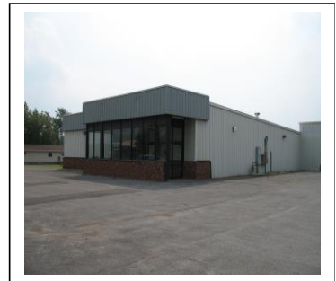
5871 Scenic Ave.