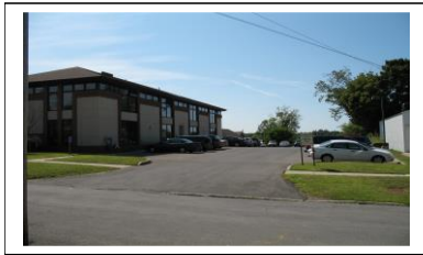
239 Oneida St.