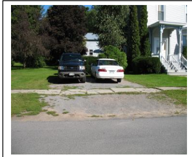
2 Washington Ave.