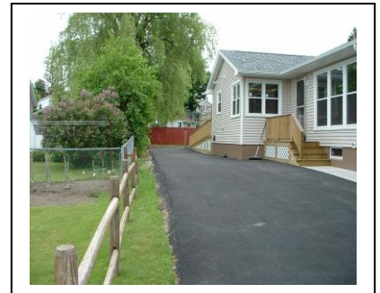
25 Dublin St.