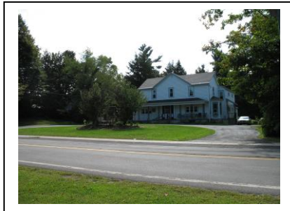
19 County Rt. 24