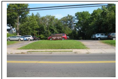
307 Oneida Street Overflow Parking lot