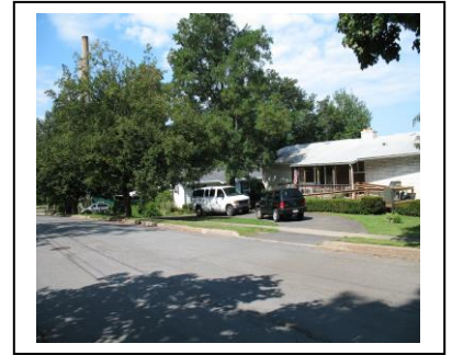
45 Bronson St.