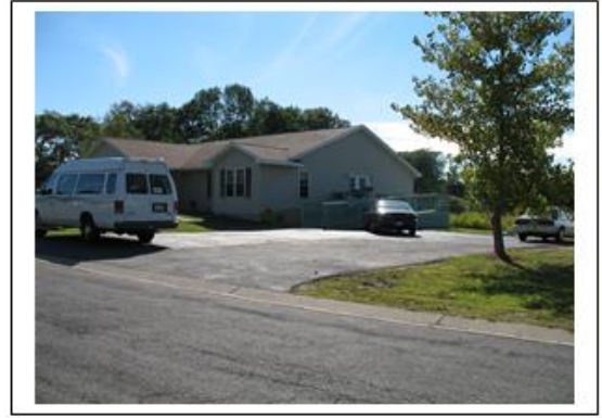
9 Salmon Meadow IRA