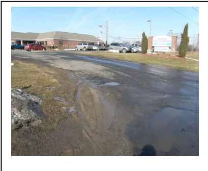
10 George St.