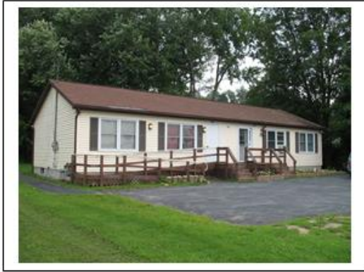
108 North Street IRA