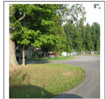
Discovery Learning Center

Each bidder must submit their proposal to the address below by September 22, 2023, at 4:30pm. Hard copies, as well as email submissions are acceptable. Thank you for your time and consideration.