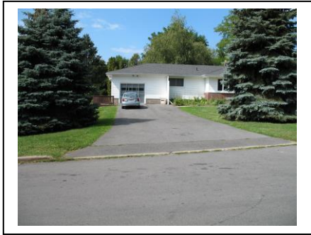
254 E. 12 th St.