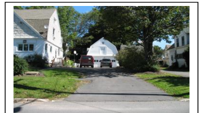
354 East Broadway