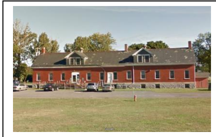
45 Schuyler St.