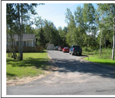
161 Ames Street