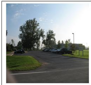
Discovery Learning Center