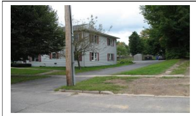
320 Erie St.